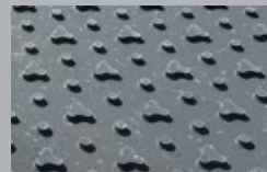
Side 1: Tire Track Surface